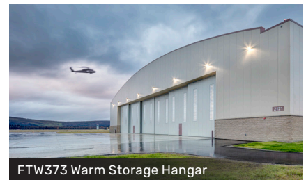
FTW373 Warm Storage Hangar