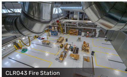
CLR043 Fire Station