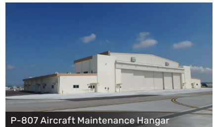
P-807 Aircraft Maintenance Hangar