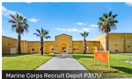
Marine Corps Recruit Depot P317U