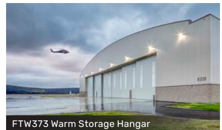
FTW373 Warm Storage Hangar