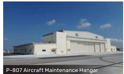
P-807 Aircraft Maintenance Hangar