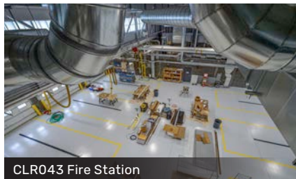
CLR043 Fire Station