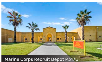
Marine Corps Recruit Depot P317U